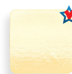
Hydrogel Sheet (Non-Adhesive)