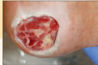
Week 3 After 2 more applications of MediHoney, the wound measured 2.5 x 2.5 cm and had 20% yellow stringy slough and 80% granulation tissue.