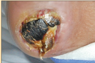
Day 0 DFU measuring 3.0 x 3.0 cm with 100% necrotic tissue.