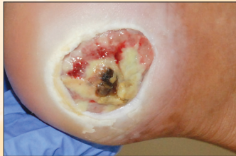
Day 2 2 days after MediHoney was applied, wound is still 3.0 x 3.0 cm, but now has yellow stringy slough and granulation tissue.