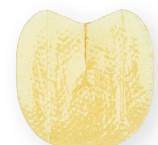
HCS - Fenestrated (Non-Adhesive)