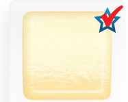
Hydrogel Sheet (Adhesive)