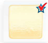
Hydrogel Sheet (Adhesive)