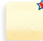
Hydrogel Sheet (Non-Adhesive)