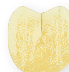
HCS - Fenestrated (Non-Adhesive)