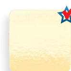
Hydrogel Sheet (Non-Adhesive)